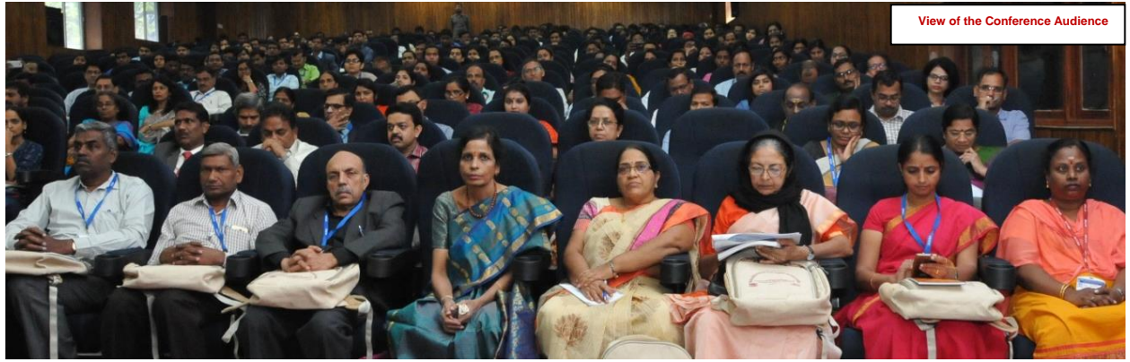
View of the Conference Audience