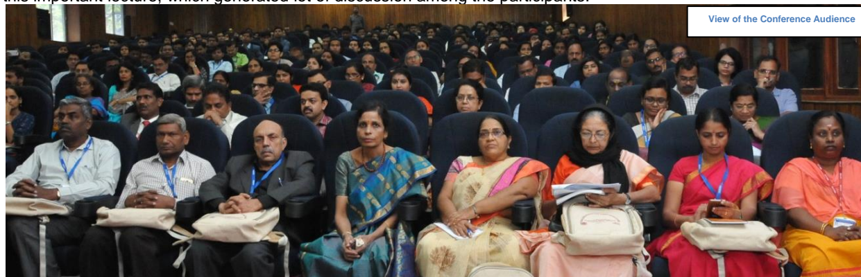
View of the Conference Audience